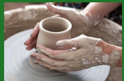
FEE BASED COURSES - PAGE 14-15