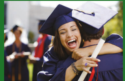
HS DIPLOMA - PAGE 6