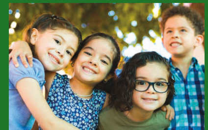
PARENT EDUCATION - PAGE 15