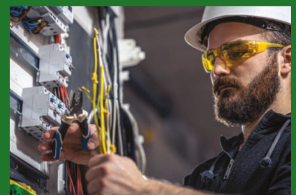
CAREER TECH - PAGES 7 - 12