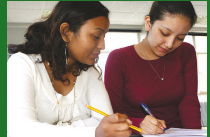
ESL - PAGE 5

The information printed herein regarding fees, class times and location is up to date at the time of printing. Please direct any questions about the courses or programs to the Main Campus/Pioneer Center located at 160 N. Barranca Avenue, Covina, CA 91723, or call (626) 974-4200. For more information, please visit our website at: www.tri-communityadulthood.org